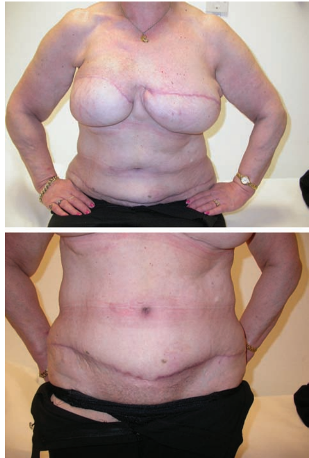
Fig. 1. Postoperative views after deep inferior epigastric perforator reconstruction.

Radiotherapy following mastectomy is associated with volume loss, fat necrosis, and deformity of free flap reconstructions. 4 For these reasons, delayed reconstruction has gained favor recently. The detrimental effects on the microvascular system that result from radiotherapy are well documented, 1 and these effects, in addition to surgical scarring, can make the recipient vessels unsuitable for free flap anastomosis. Some studies suggest unusability rates of up to 20 percent for the